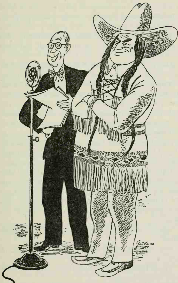
Chief Wahunsonacook was making a good-will tour of the country